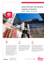
Leica RTC360 3D Reality Capture Solution

Active Customer care is a true partnership between Leica Geosystems and its customers. Customer Care Packages (CCPs) ensure optimally maintained equipment and the most up-to-date software to deliver the best results for your business. The myWorld@Leica Geosystems customer portal provides a wealth of information 24/7.