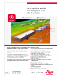
Leica Cyclone MODEL

Leica Geosystems AG Heinrich-Wild-Strasse 9435 Heerbrugg, Switzerland +41 71 727 31 31